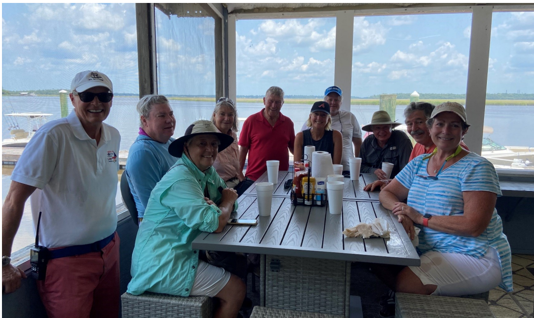
July 31 lunch at the Satilla Riverside Café on Fancy Bluff Creek.