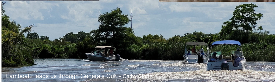
Lamboat2 leads us through Generals Cut. - Cathy Stott

More cruise pictures on the next two pages.