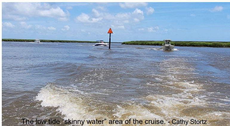
The low tide "skinny water" area of the cruise. - Cathy Stortz