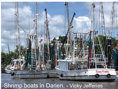
Shrimp boats in Darien. - Vicky Jefferies