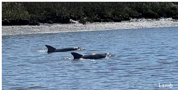
Dolphins in the Mackay River.