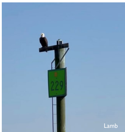
Bald eagle sitting atop ICW marker at the Northern entrance to the Frederica River off the Mackay.