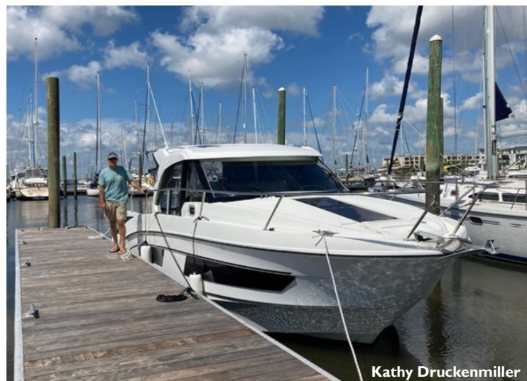
Steve Druckenmiller stands next to their new Beneteau Antares 27.