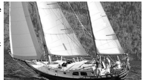
Sistership of the Mokolea