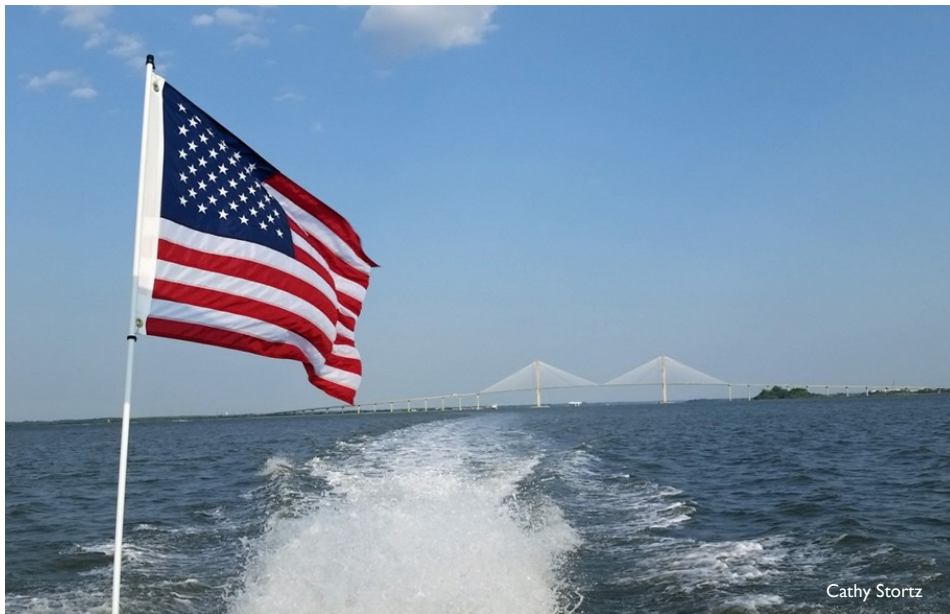
Picture from 2019 cruise with Sydney Lanier Bridge in background.