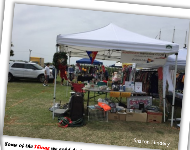
Some of the Things we sold during the 2018 Peaches to Beaches event.