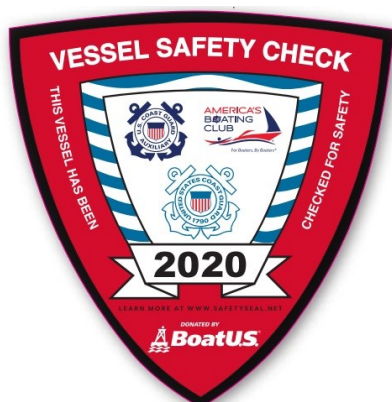
2020 Vessel Safety Check Decal