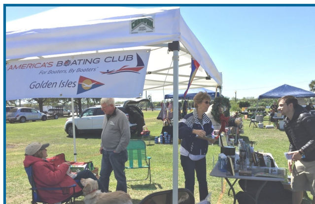
This picture is from the last time we participated in Peaches to Beaches Yard Sale.