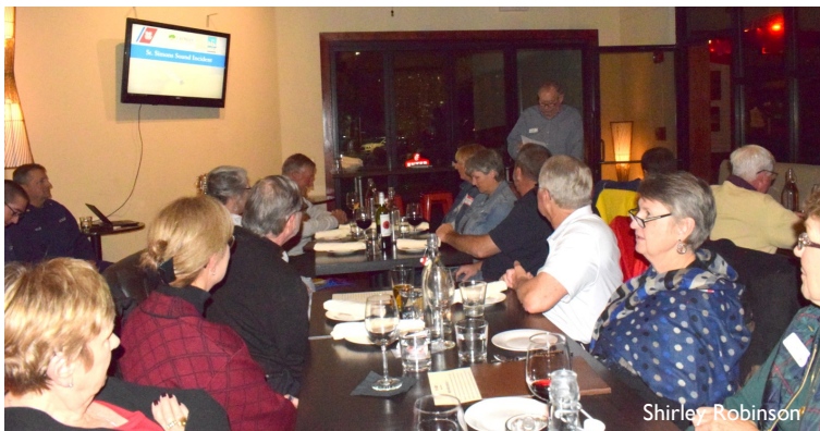
We had a good turn out for the January dinner.