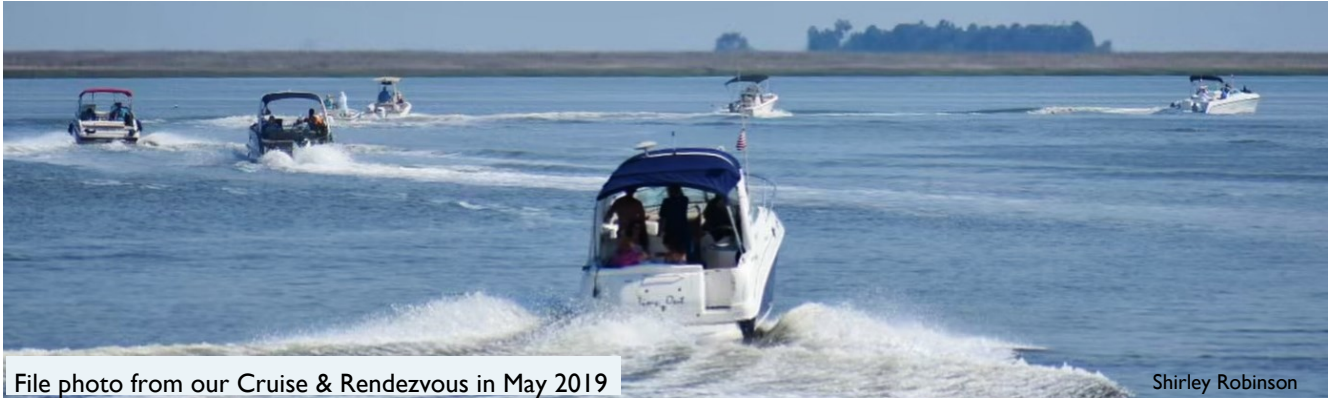
File photo from our Cruise &amp; Rendezvous in May 2019