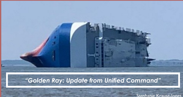
"Golden Ray: Update from Unified Command"