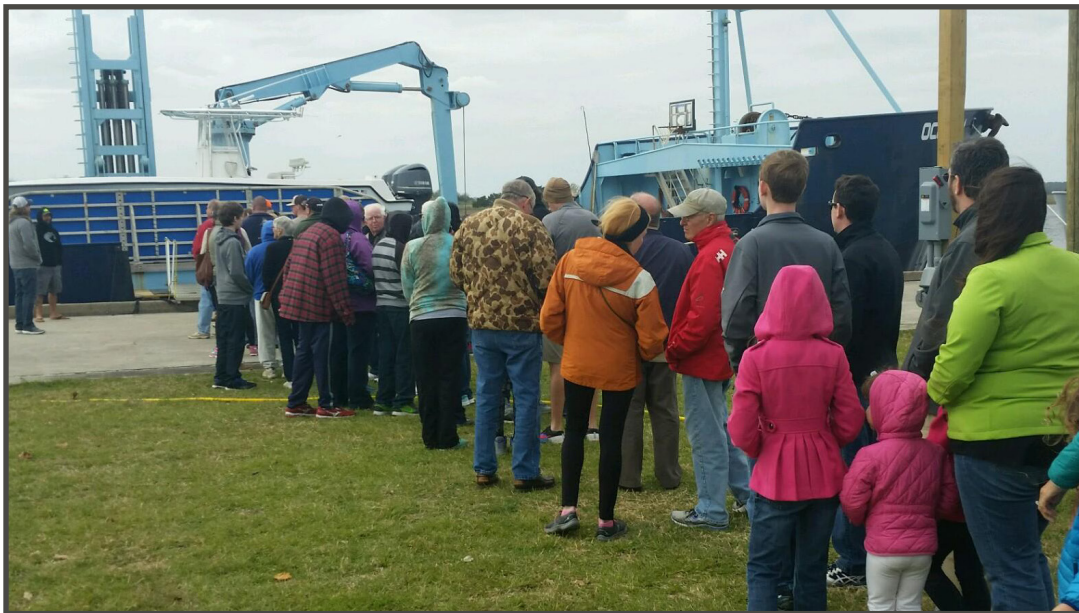
Long lines for the last day of public tours