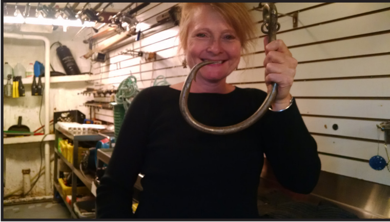
How to catch a shark...with a hook like this and a handline