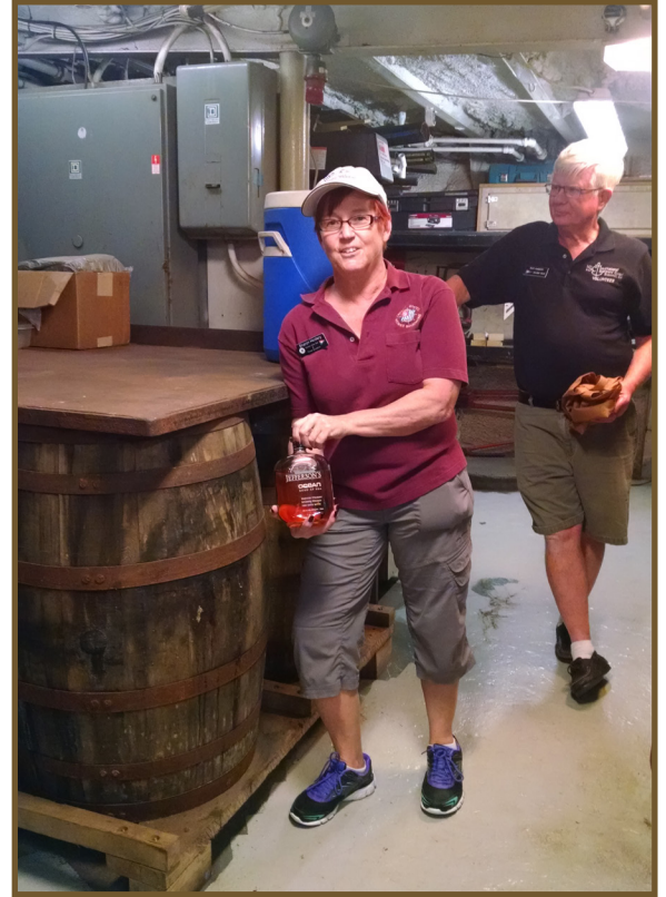
8e Just had to get a pic with My Jefferson's Oceans bottle's decedents