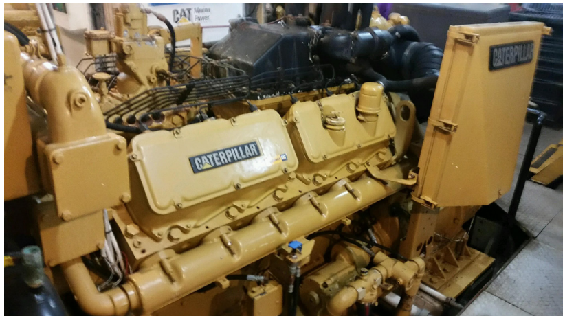
Impressive engines that power the boat