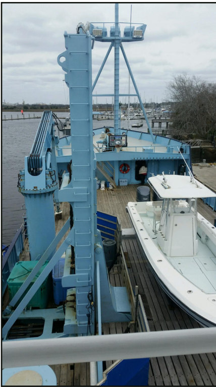
The lift and crane that makes this ship uniquely suitable for the task of tagging the sharks