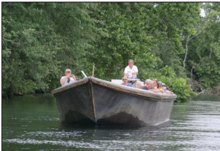
Electric powered replicas of Petersburg cargo boats carry visitors to the Augusta Canal on scenic guided tours.