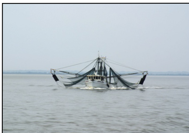
Shrimp boat leaving Brunswick, GA

I reported last month that we had lost 3 active and 1 family members. Unfortunately these members have not renewed, but I am