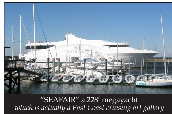
"SEAFAIR" a 228' megayacht which is actually a East Coast cruising art gallery