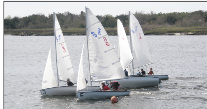
The Local High School 420 sail boat competition rounding the marks

rounding around the marks. I hope to see you all the District 26 Spring Conference and if I miss you there I will see you at our next meeting April 19, all for now.